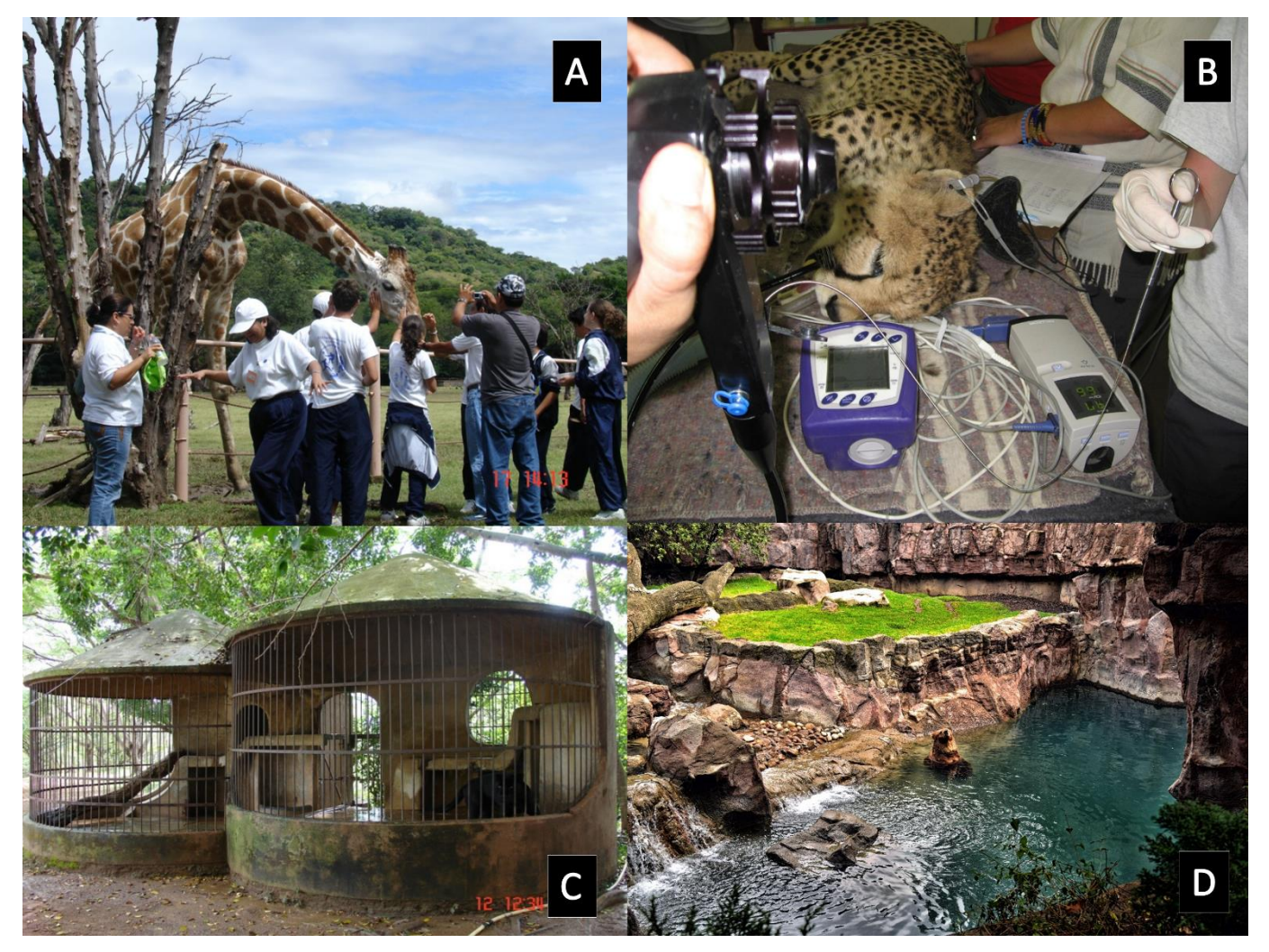
Figure 1 A. Zoo educators rely on interactive experiences to create a bond between visitors and endangered species. B. Zoos promote research in different aspects of animal health and management and facilitate the training of many professionals working in field conservation projects. C. Black jaguar confined in an inappropriate space of barren concrete and metal bars with no enrichment. D. The environmental enrichment programmes in zoos include the design of naturalistic exhibits.