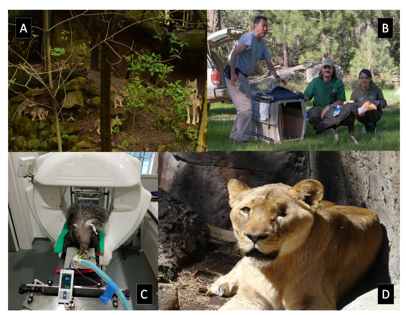
Figure 3 A. Breeding Mexican wolves in zoos has been essential for the conservation of this species. B. Reintroduction of zoo born California condors into the wild is a fundamental part of the conservation programme of this highly endangered species. C. Advanced diagnostic and therapeutic technologies should be available in zoos to ensure the health and welfare of wild animals in human care.D. Rescued lion showing signs of animal abuse.