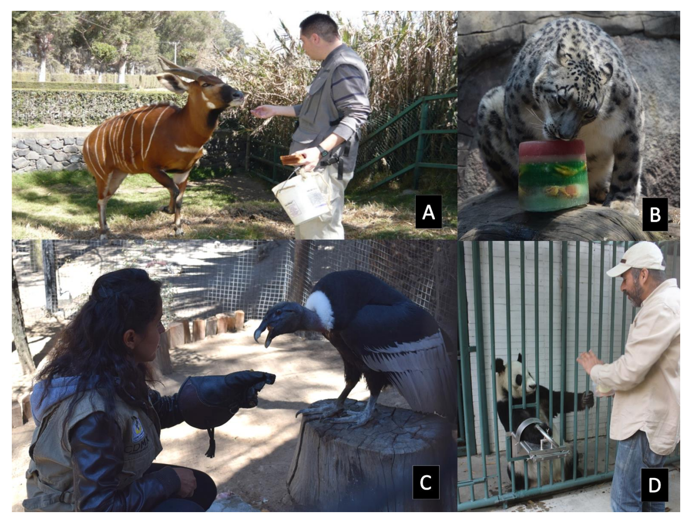
Figure 2 A. Positive caretaker – animal relationship avoids stress in routine care and facilitates training of zoo animals. B. Behavioural enrichment activities in zoos improve individual animal welfare and favour learning experiences in zoo visitors. C, D. Operant conditioning / Positive reinforcement techniques are used to train different species of wild animals in zoos to reduce stress and avoid the need of chemical immobilization for health screenings and medical procedures.

giraffes, felines, and other large carnivores, non-human primates, dolphins, and sea lions, among others). These techniques are considered an enrichment strategy with positive outcomes for the animal, its keepers, and veterinarians, aiding in their handling and reducing both the risks associated with interacting with such animals to staff and the inherent risk of physical and chemical immobilization (Laule and Desmond 1998) (see Figures 2C and 2D).